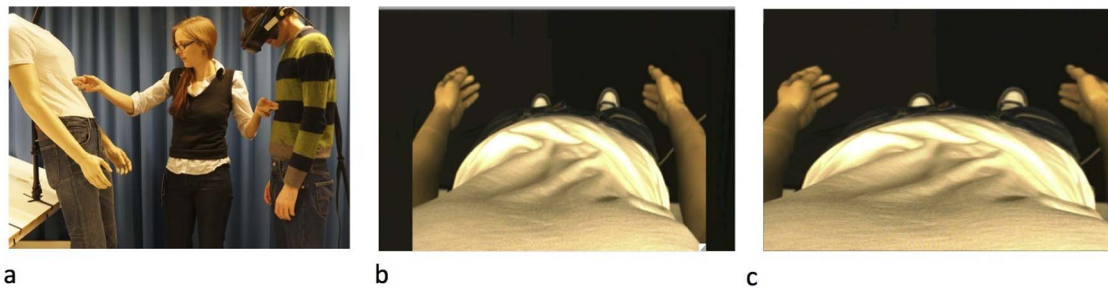
Figure 1. Experimental set-up. a) The illusion was induced by synchronously stroking the mannequin body and the corresponding part of the participant's body. Participant view through the head mounted display of the male mannequin in the small (b) and large (c) body conditions. Both subjects in the figure have given written informed consent, as outlined in the PLOS consent form, to publication of their photograph. doi:10.1371/journal.pone.0085773.g001

were given between each trial. The duration of the entire experiment was approximately 50 minutes. Subjective responses were taken at the end of the experiment to keep participants naïve as to the purpose of the study for as long as possible. Similarly, subjective responses were only taken once per condition to prevent participants from guessing the aim of the experiment and thus reducing the possibility of demand characteristics. This approach has been used by previous similar studies (e.g. [20]).