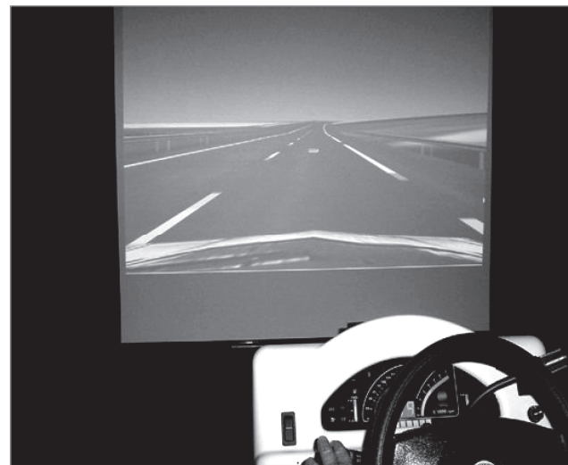
Figure 1 —Example of the visual interface of the simulator used for the experiment.

The VAMS comprised nine 100-mm lines anchored by antonyms (alert/drowsy, attentive/dreamy, muzzy/clear-headed, mentally slow/quick-witted, lethargic/energetic, well